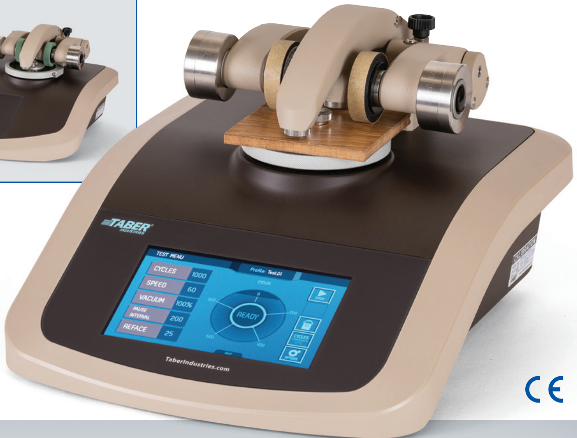
MODEL 1700 SINGLE PLATFORM ABRASER